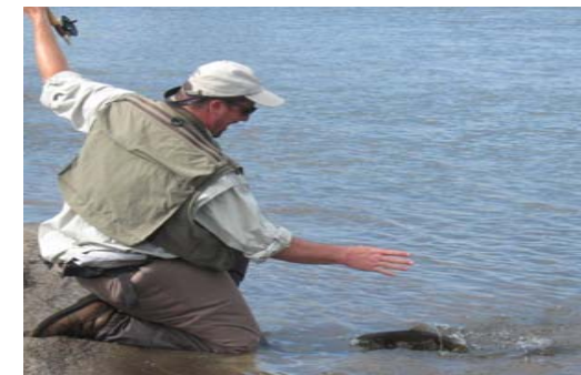
Revenge of the Trout

We believe mid-Missouri deserves a place that is more than just piles of fly fishing equipment. We want to develop something more both in services and in character. That is why Clearwater Fly Shop is now Clearwater Outfitters. We do